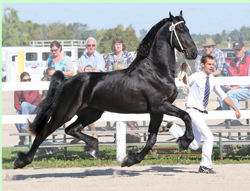
Jakob KCF (Norbert 444 x Beart 411)

The testing began Dec. 19th, 2014 with the second viewing taking place Jan. 23-24, 2015 and the finals taking place Feb. 27-28, 2015.