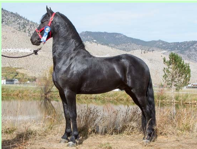
Krino van het Kasteel (Maurus 441 x Beart 411)